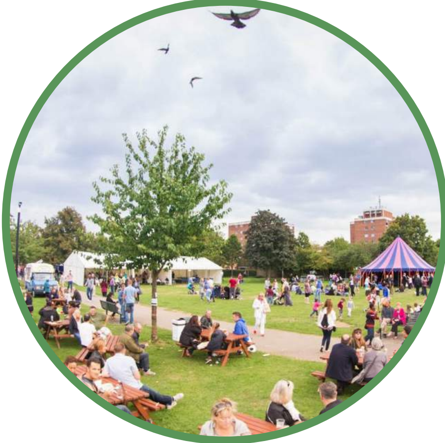
ENSURING THERE IS SUFFICIENT OPEN SPACE For events, festivals and fairs