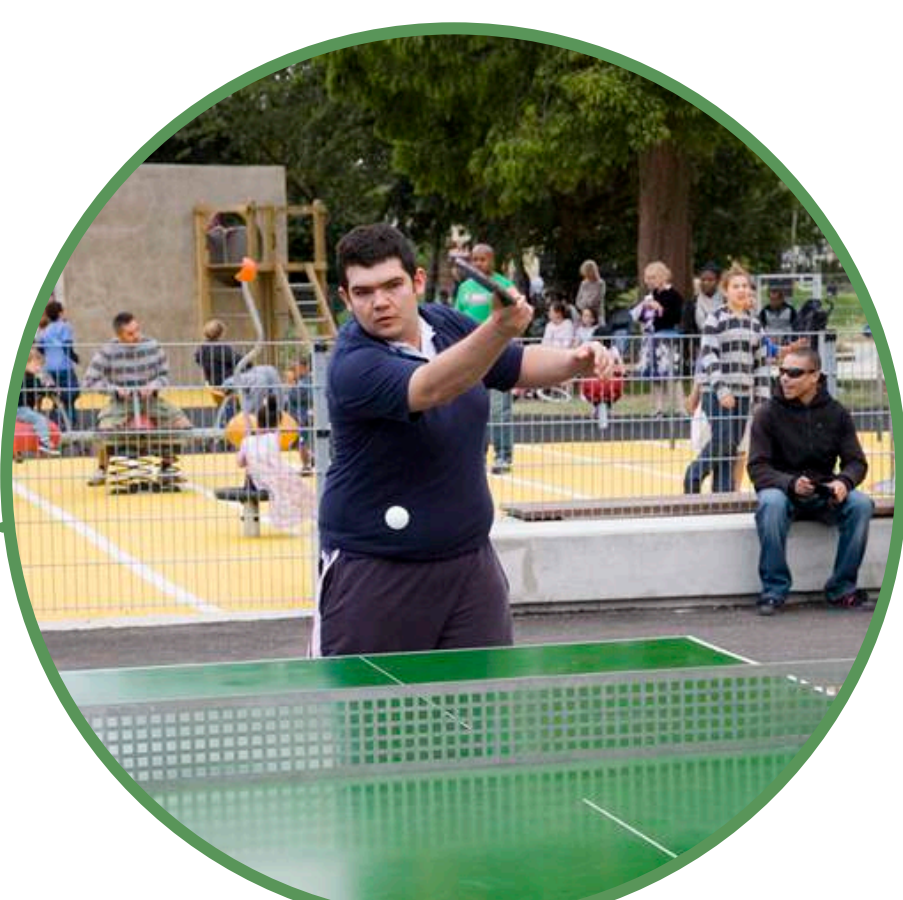
CROSS GENERATIONAL Cross generational play avoids territorialisation of space. Play should avoid segregating children on the basis of age or ability