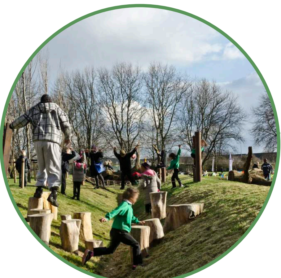
TIMBER Play should make use of natural elements.