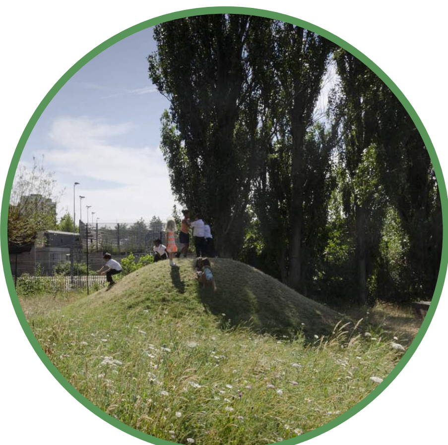
LANDFORM Play should be non-prescriptive and help define the character of the park.