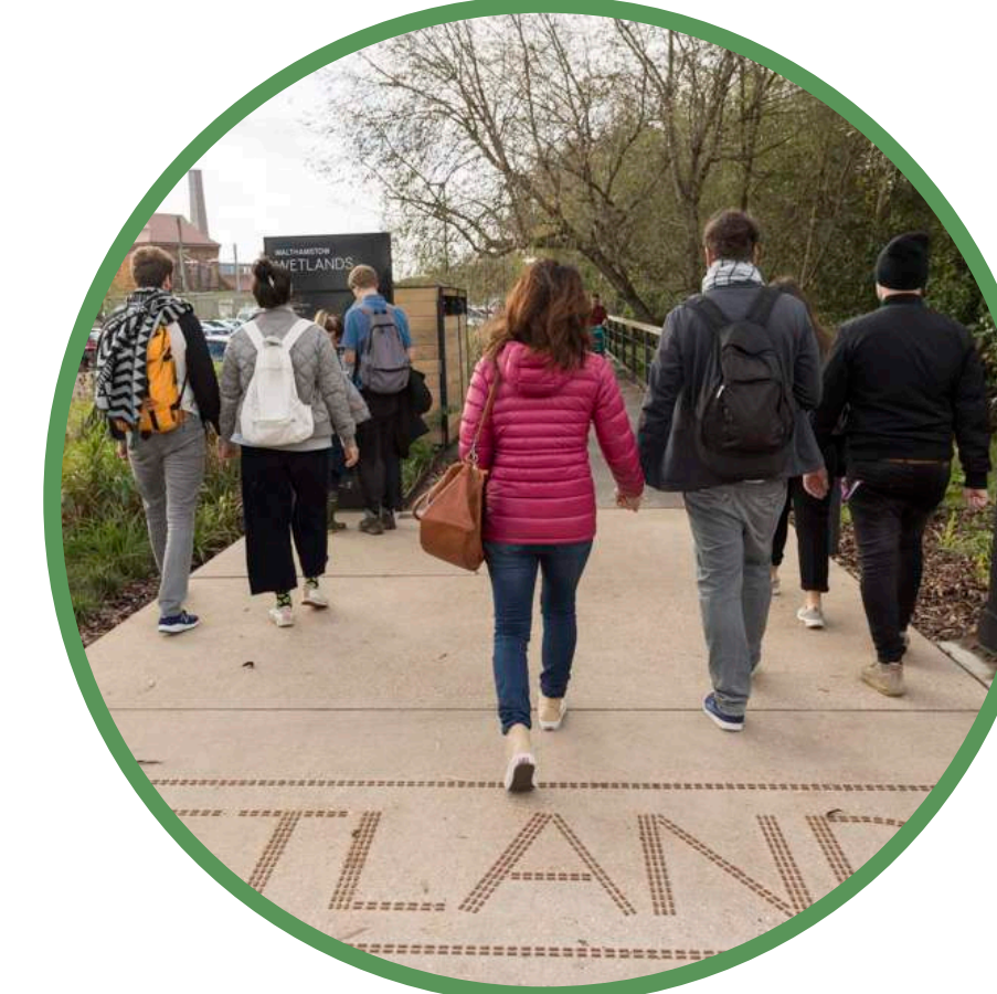
DEFINE ENTRANCES Create legible and characterful thresholds. Create a sense of arrival.