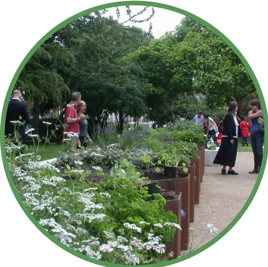
COMMUNITY GROWING Help activate Leeland Terrace. Create community cohesion