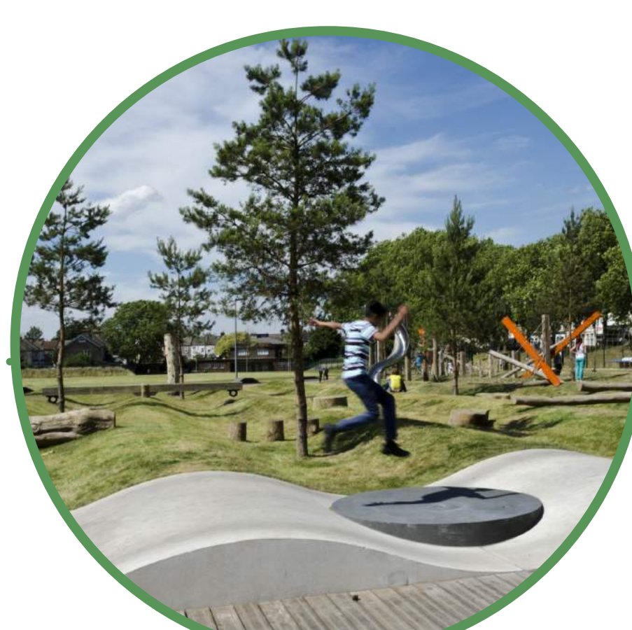
PLAY INTO SPORT Encouraging a route to sport through play. Play should allow children to develop skills and coordination.