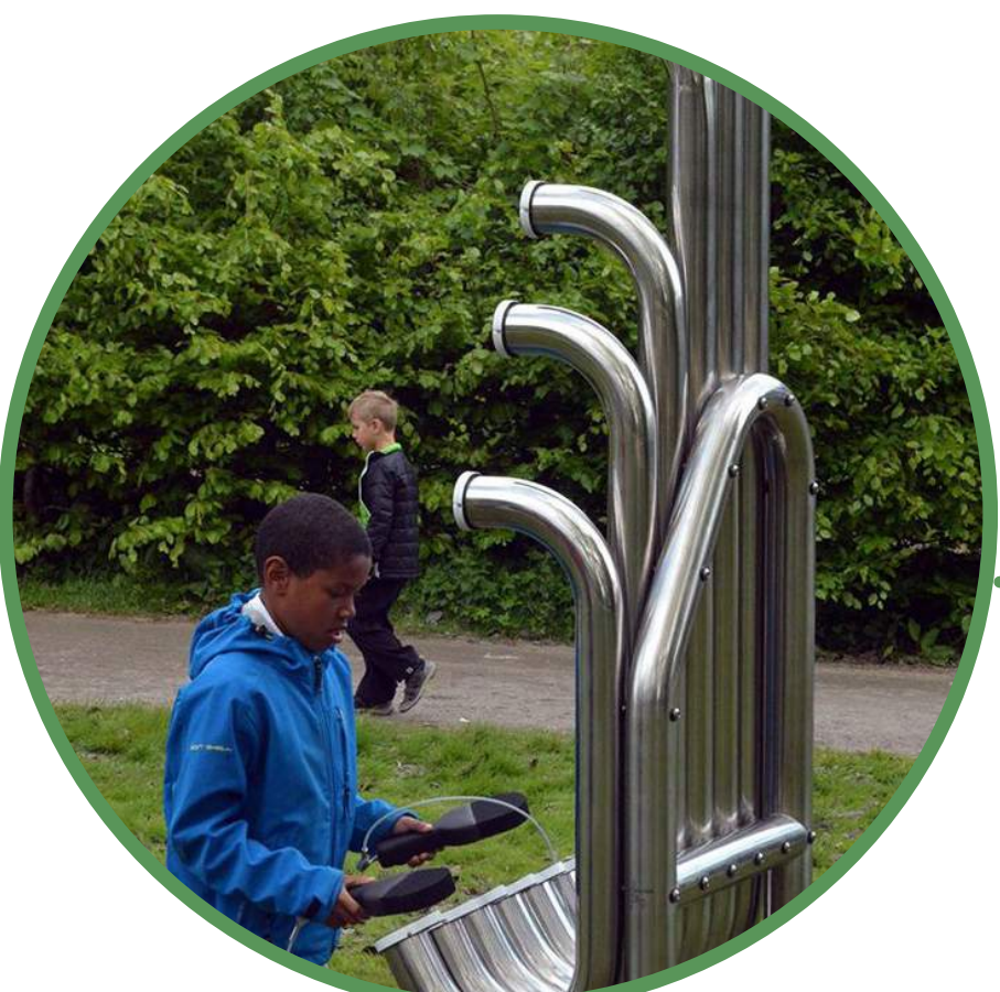
SENSORY Successful play stimulates the five senses, providing access to music and sound, and different smells made by plants and leaves.