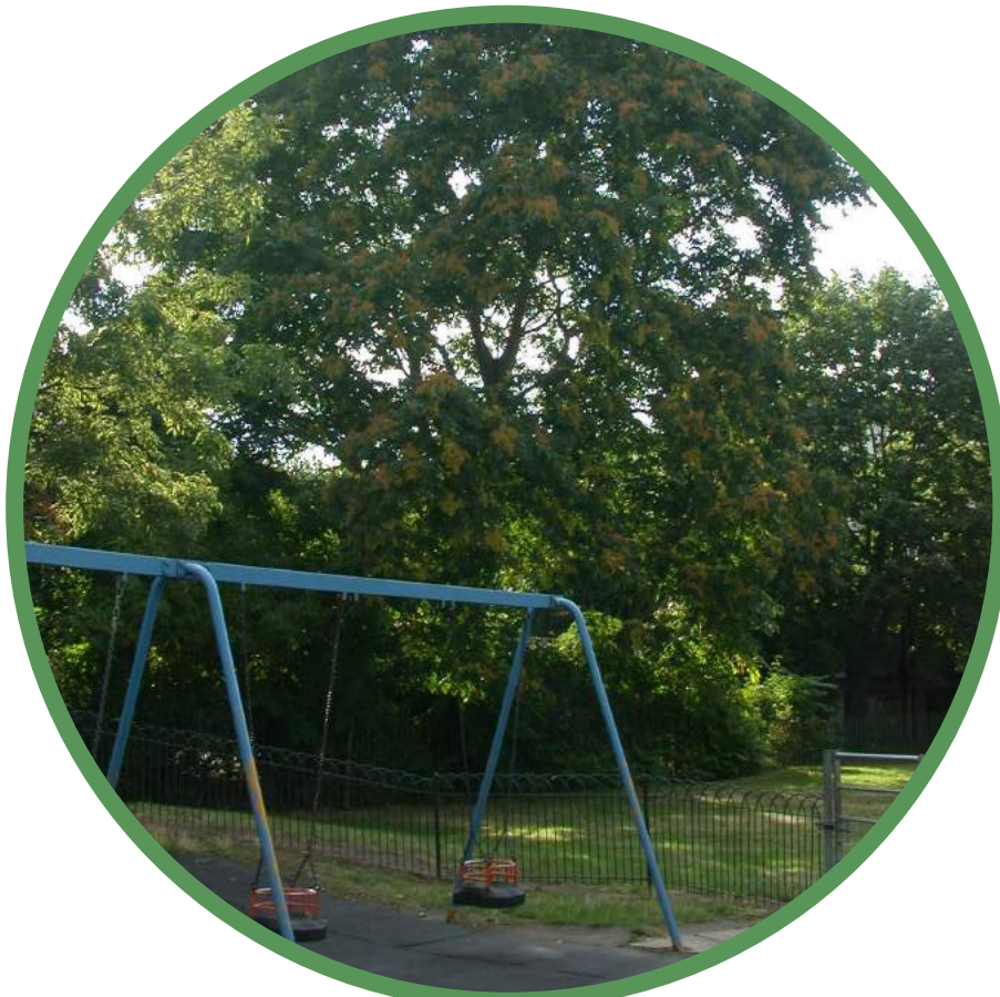
CANOPY LIFTING Normand Park before. Dark, poor visibility.