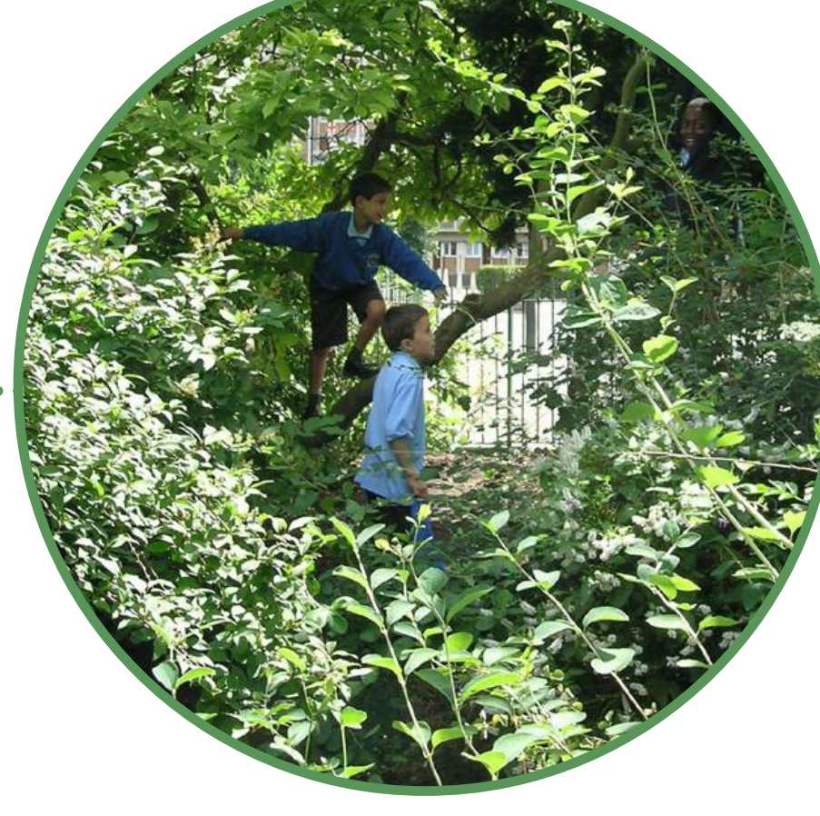
CLIMBING Play should build in opportunities to experience risk and challenge.