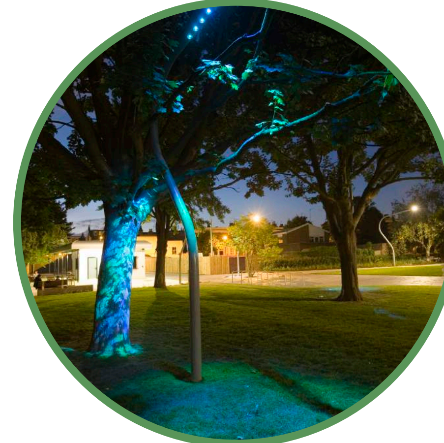
LIGHTING THE PARK Ensuring suitable lighting throughout the park to encourage a night time economy