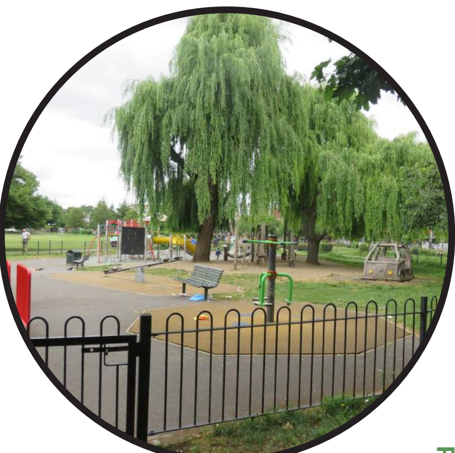
EXISTING PLAYGROUND • Very popular and well used • "Tired and in need of an update" • Urbanises the Park • Does not fit into natural play category • Play equipment is prescriptive • Not a good relationship with the Willow Trees (although shade is important) • Fragmented, unattractive surfaces which do not contribute to play value • Collaborative play opportunities limited • Landform not used for play • Fencing limits scope of play