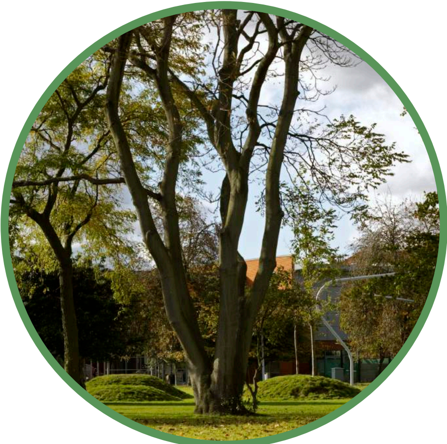
CANOPY LIFTING Normand Park after. Light, good visibility and retention of important trees.